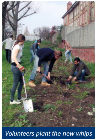
Volunteers plant the new whips

All the hard work has seen great results as Little Wormwood Scrubs has this year achieved its first Green Flag!