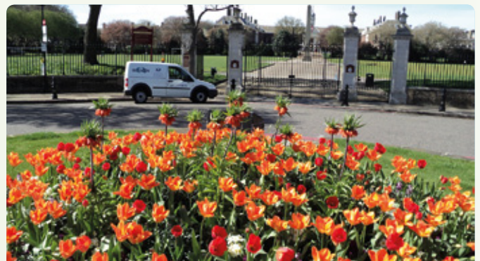
The same planter in Spring