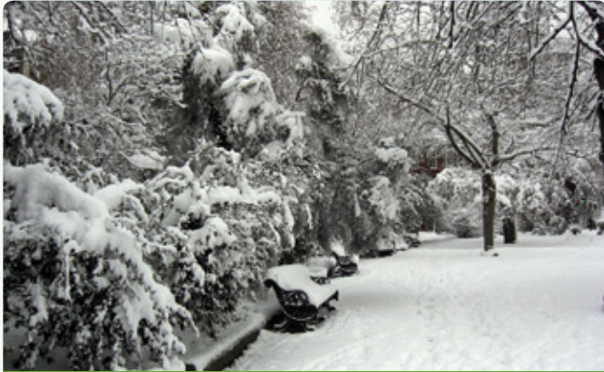
Embankment in January (above) and then in April (below)