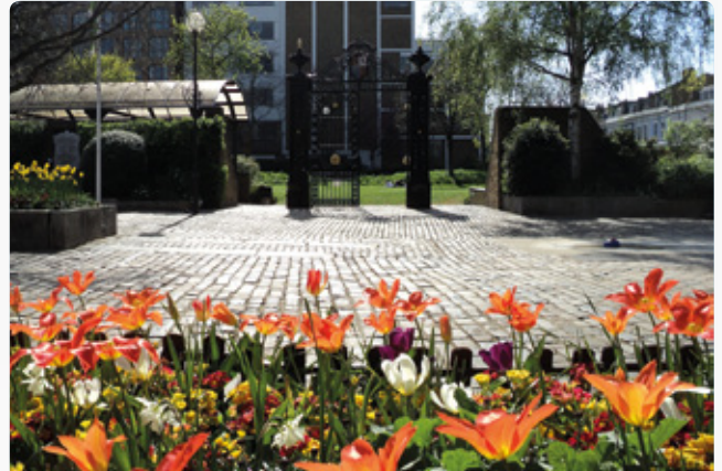
Spring bulbs at Cremorne