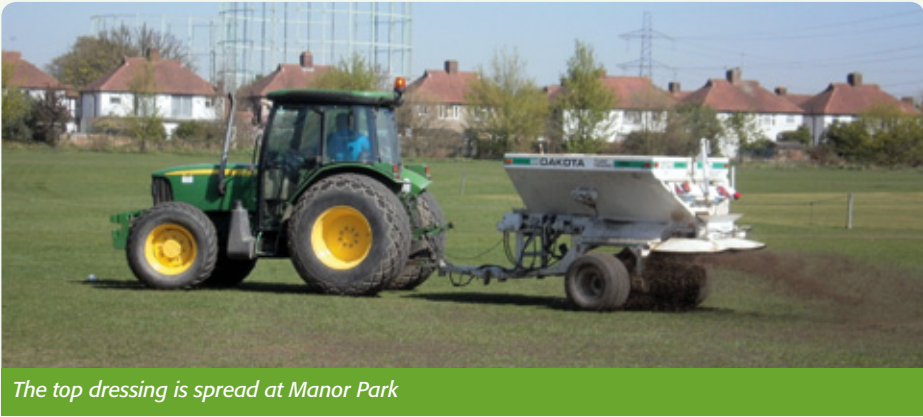
The top dressing is spread at Manor Park