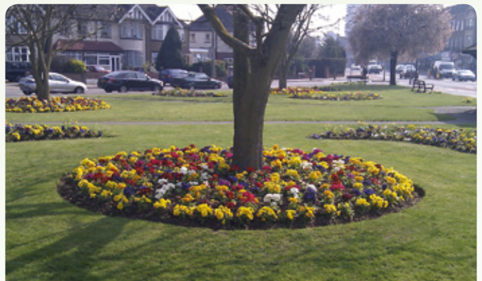
Red Lion Road