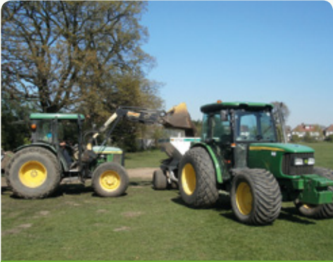
Loading the top dresser