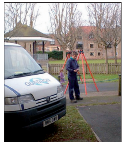
▲ INSPECTING PARKS: Keeping them safe