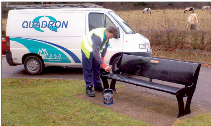
▲ Monthly inspections and emergency work

Because of this, inspections are made monthly in towns and bi-monthly in rural areas and emergency work is undertaken at the time of the inspection.