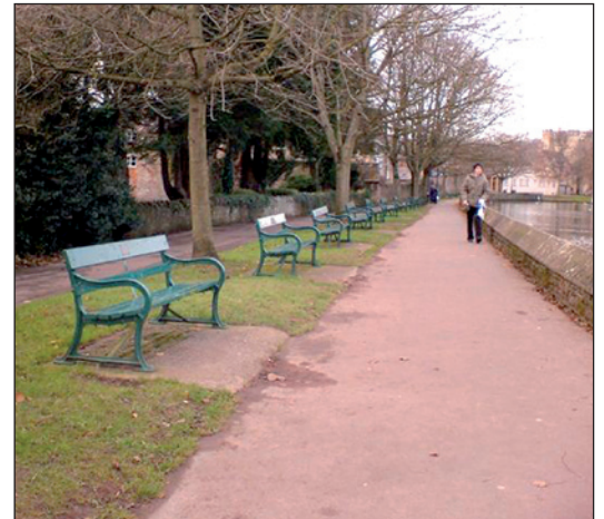
▲ LOCAL PARKS: There for you

features within your area. As well as including the obvious tasks such as shrub bed maintenance, Quadron also cuts the grass, maintains the playgrounds and skate parks and looks after the street furniture and street name signs.