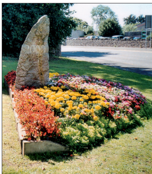
▲ Mendip in Bloom