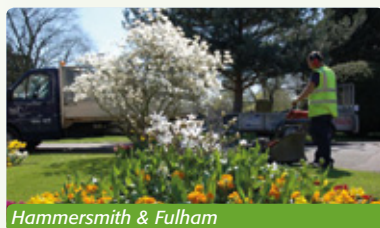
Hammersmith & Fulham