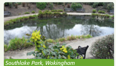
Southlake Park, Wokingham