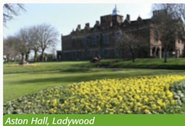
Aston Hall, Ladywood