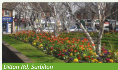
Ditton Rd, Surbiton