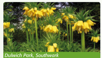
Dulwich Park, Southwark